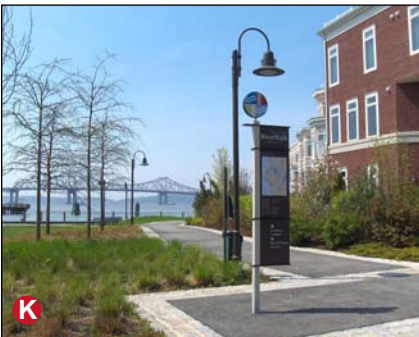
K Ichabod's Landing, Sleepy Hollow