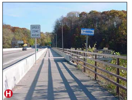
H 'Crossing' Greenway Bike/Ped Path along Route 9 over Croton River