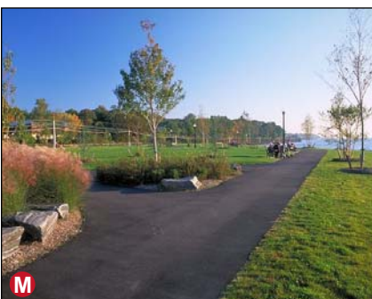
M RiverWalk at Scenic Hudson Park Village of Irvington