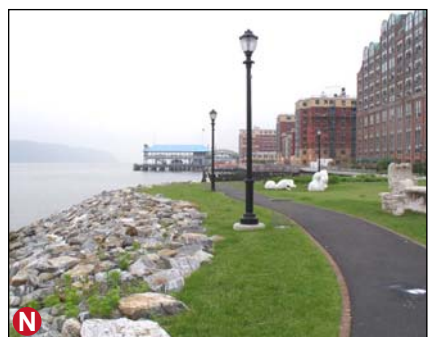
N Hudson Park, Yonkers Waterfront