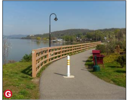
G RiverWalk at Croton-on-Hudson