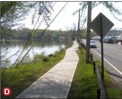
D Kings Ferry Road Path along Lake Meahagh, Montrose