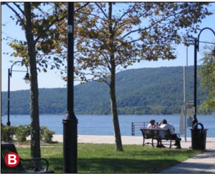
B Riverfront Green Park, Peekskill