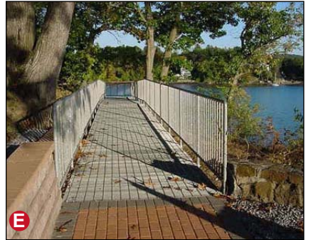
E RiverWalk at VA Hospital, Montrose