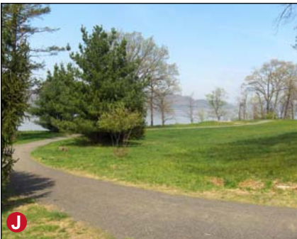
J Rockefeller State Park Rockwood Hall area