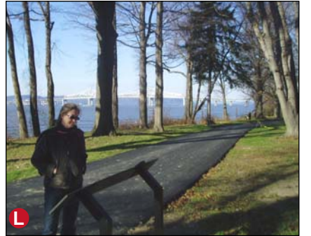
L RiverWalk at Lyndhurst Estate Village of Tarrytown