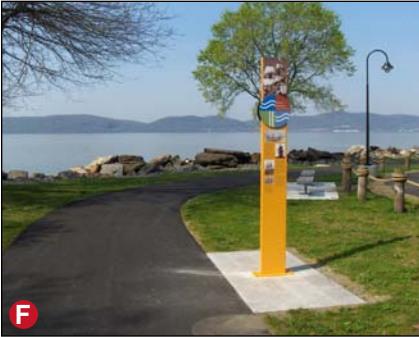
F RiverWalk at Croton-on-Hudson