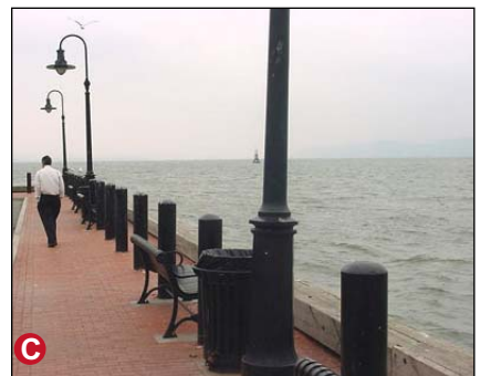
C Steamboat Riverfront Park, Verplanck