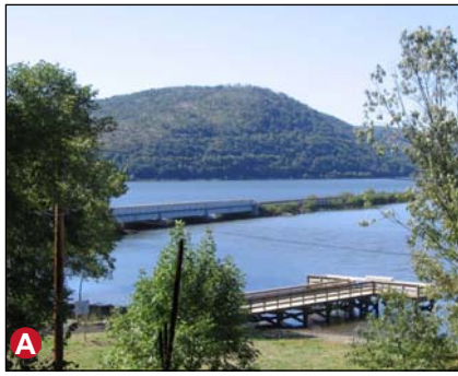
A Annsville Preserve, Peekskill